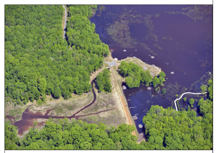
Arial photo of completed berm (straight line in the bottom middle of photo) backing up the water and creating wonderful wildlife habitat.

The current Fairfax County Department of Transportation (DOT) proposed paved bike trails are specifically intended for transportation and commuting. Construction of the northern proposed paved trail would entail the same conversion of this portion of the Park to a transportation corridor as was proposed in the late 1980s. Due to the deed restrictions for HMP property, pursuing such construction would most likely require federal approval and additional costly actions, including a detailed, site-specific environmental review which has never been done for these proposed trails.