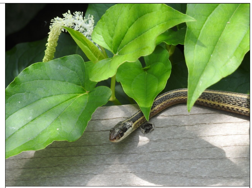
Ribbon Snake on central wetlands boardwalk in front of blooming Lizard's Tail (Saururus cernuus L.).

HMP is also an internationally recognized nature and wildlife tourism site that brings tourism revenue to the County. With a Trip Advisor Certificate of Excellence, HMP is rated as #2 of 97 things to do in Alexandria. Fairfax County's Economic Development Agency uses